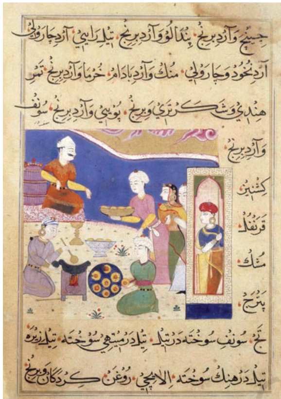
Nimatnama, Mandu, 1550, British Library, London

Persian, Turkic and Afghan—percolated into the mainland and appeared in the paintings patronised by the Sultans of Malwa, Gujarat, Jaunpur and such other centres. With few Central Asian artists in these courts working with local artists, an intermingling of Persian features and indigenous styles led to the emergence of another style that is referred to as the Sultanate School of Painting.