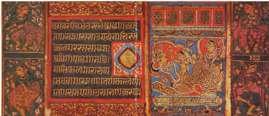
Birth of Mahavir, Kalpasutra, fifteenth century, Jain Bhandar, Rajasthan