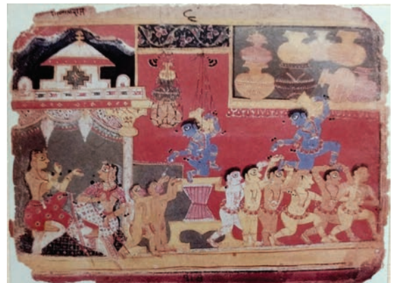
Mitharam , Bhagvata Purana , 1550

With several regions in the north, east and west coming under the rule of the Sultanate dynasties from Central Asia after the late twelfth century, another strain of influence—