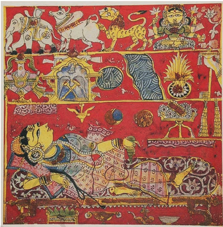
Trishala's fourteen dreams, Kalpasutra, Western India

events leading to and around these—comprise most part of the Kalpasutra .