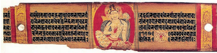
Lokeshvar, Astasahasrika Prajnaparamita , Pala, 1050, National Museum, New Delhi

This practice enabled the dispersal of Pala art to places, such as Nepal, Tibet, Burma, Sri Lanka and Java.