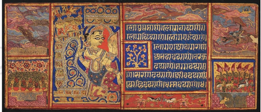
Indra praising Devasano Pado, Kalpasutra, Gujarat, about 1475. Collection: Boston

Jain paintings developed a schematic and simplified language for painting, often dividing the space into sections to accommodate different incidents. One observes a penchant for bright colours and deep interest in depiction of textile patterns. Thin, wiry lines predominate the composition and three-dimensionality of the face is attempted with an addition of a further eye. Architectural elements, revealing the Sultanate domes and pointed arches, indicate the political presence of Sultans in the regions of Gujarat, Mandu, Jaunpur and Patan, among others, where these paintings were done. Several indigenous features and local cultural lifestyle is visible through textile canopies and wall hangings, furniture, costumes, utilitarian things, etc. Features of the landscape are only suggestive, and usually, not detailed. A period of roughly hundred years from about 1350–1450 appears to be the most creative phase for Jain paintings. One observes a shift from severely iconic representations to inclusion of attractively depicted aspects of landscape, figures in dance poses, musicians playing instruments, which are painted in the margins of the folio around the main episode.